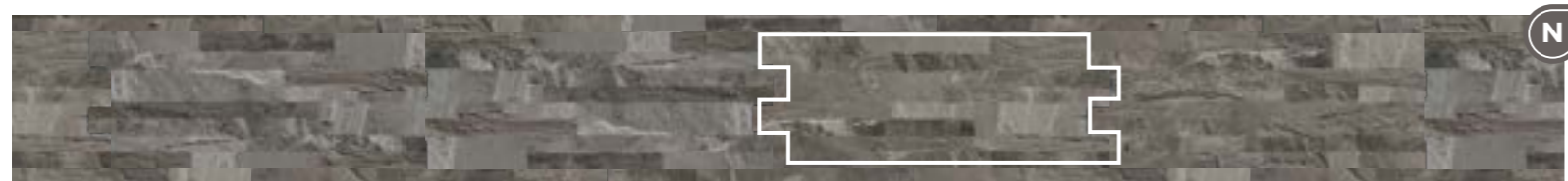
Ocean Ardesia - BKP 214