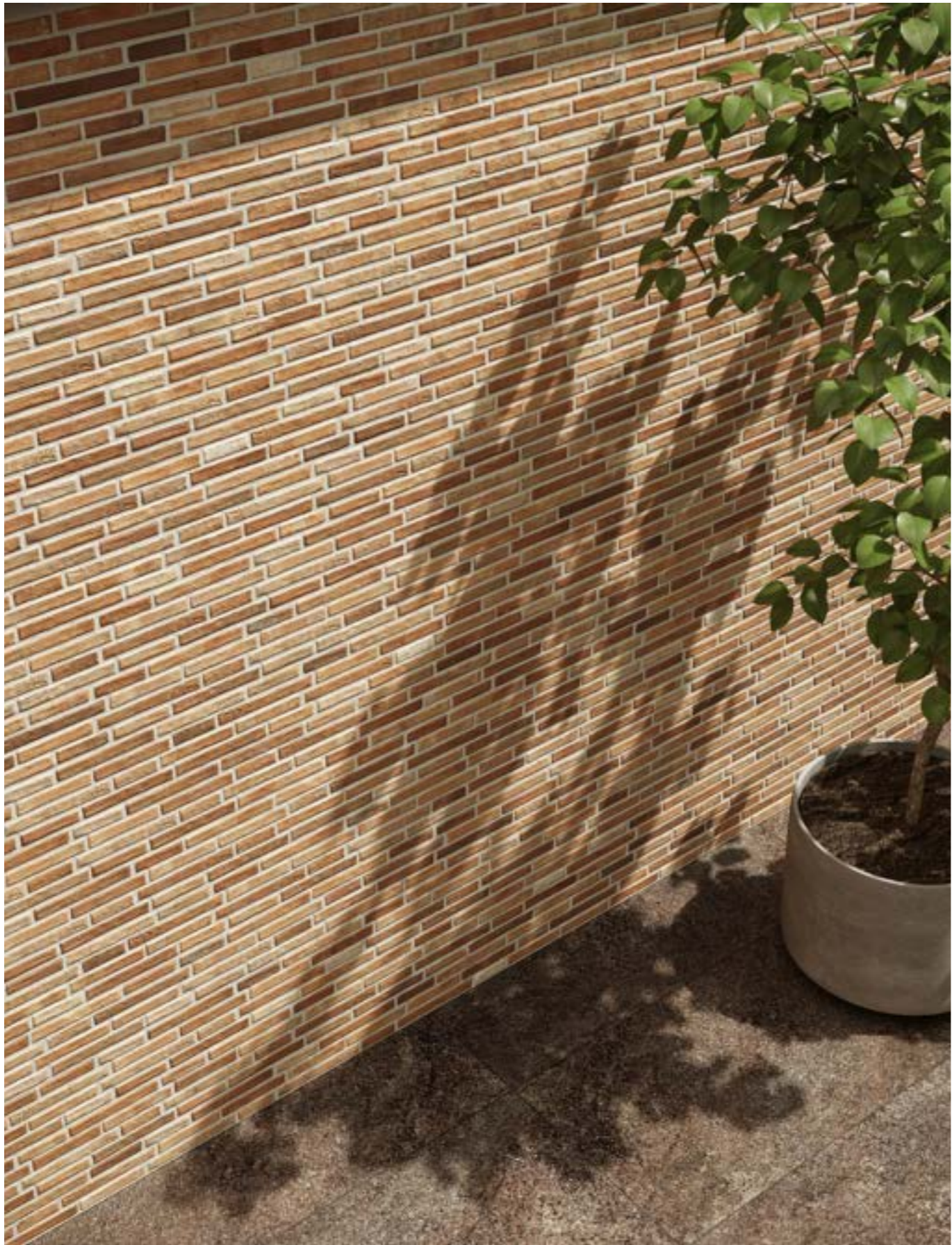
Wall: New York Red Classic 16x40 Floor: STONE BOX Paved Brown 60x120