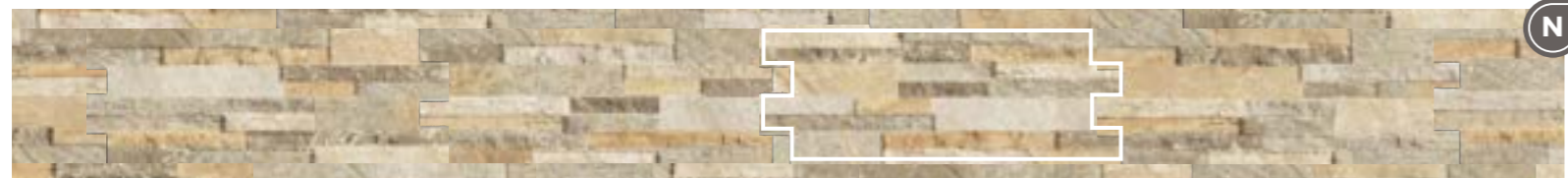
Ocean Beige - BKP 414