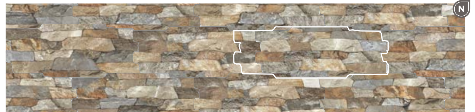
Breccia Rock Mix - BKP 640