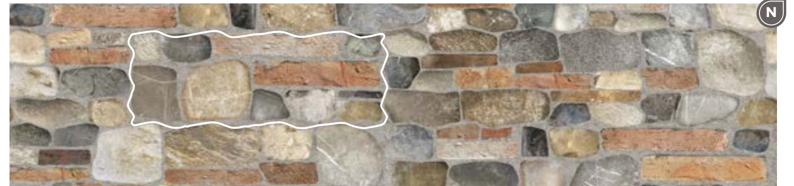
Oldwall Multicolor - BKP 664