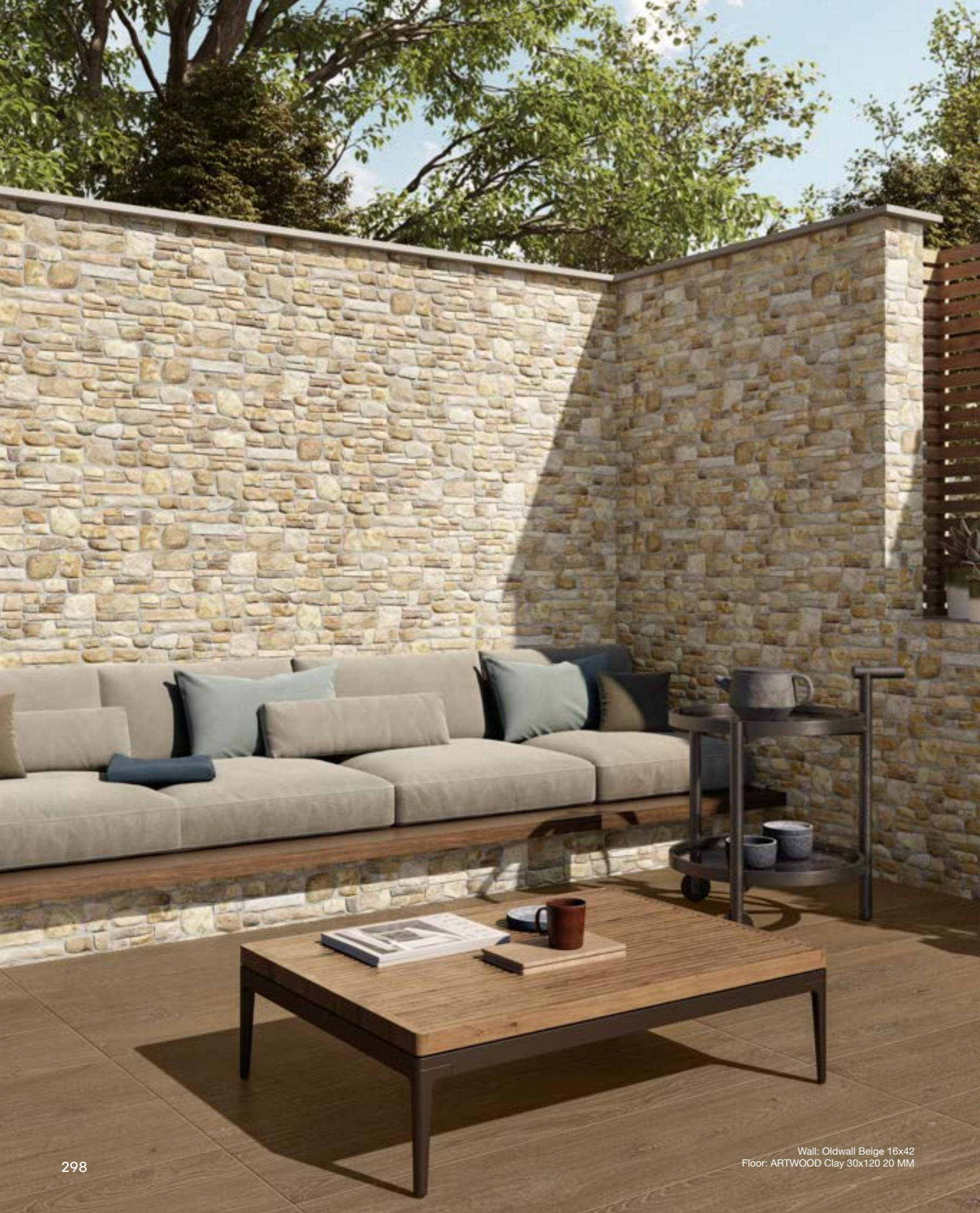
Wall: Oldwall Beige 16x42 Floor: ARTWOOD Clay 30x120 20 MM