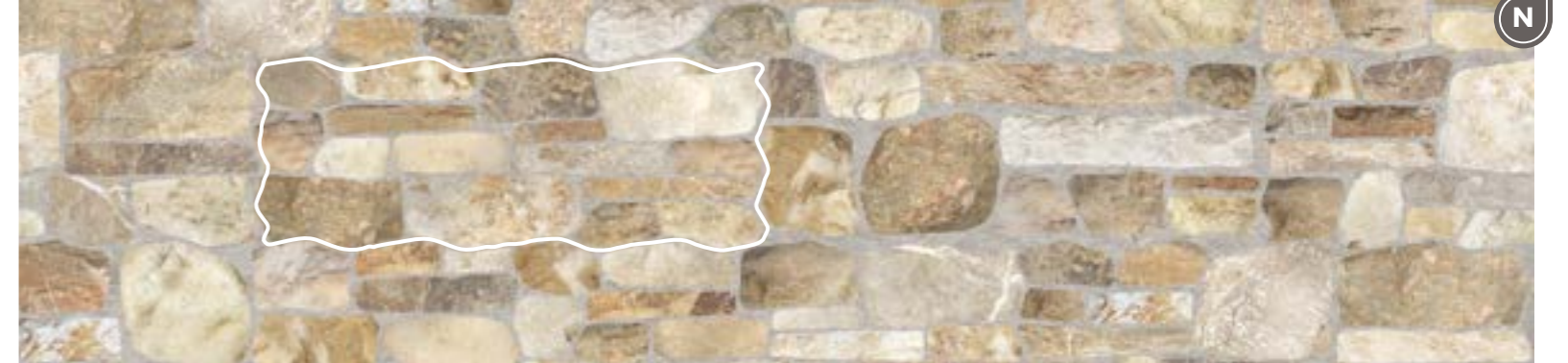
Oldwall Beige - BKP 464