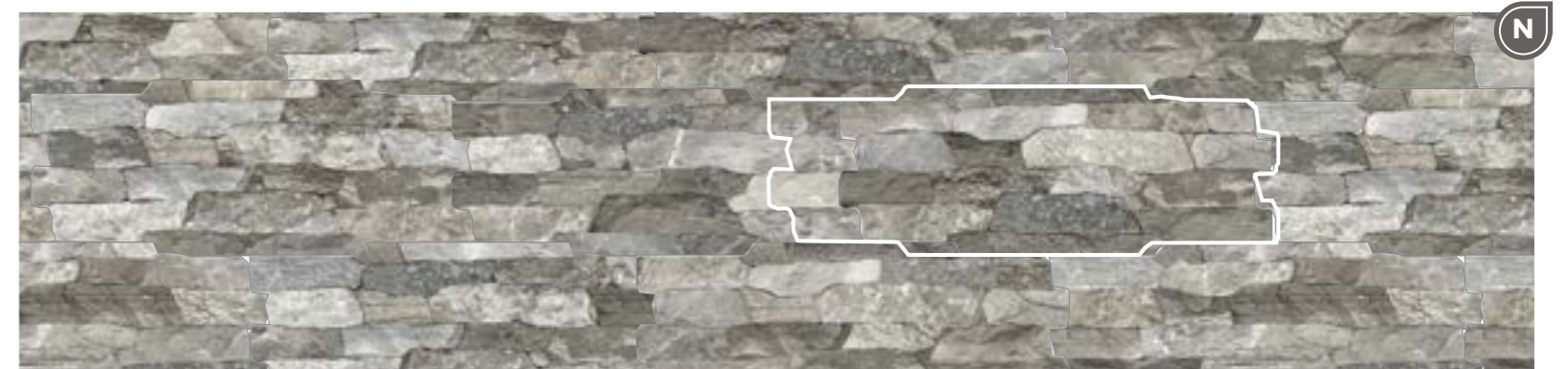
Breccia Grigio - BKP 140