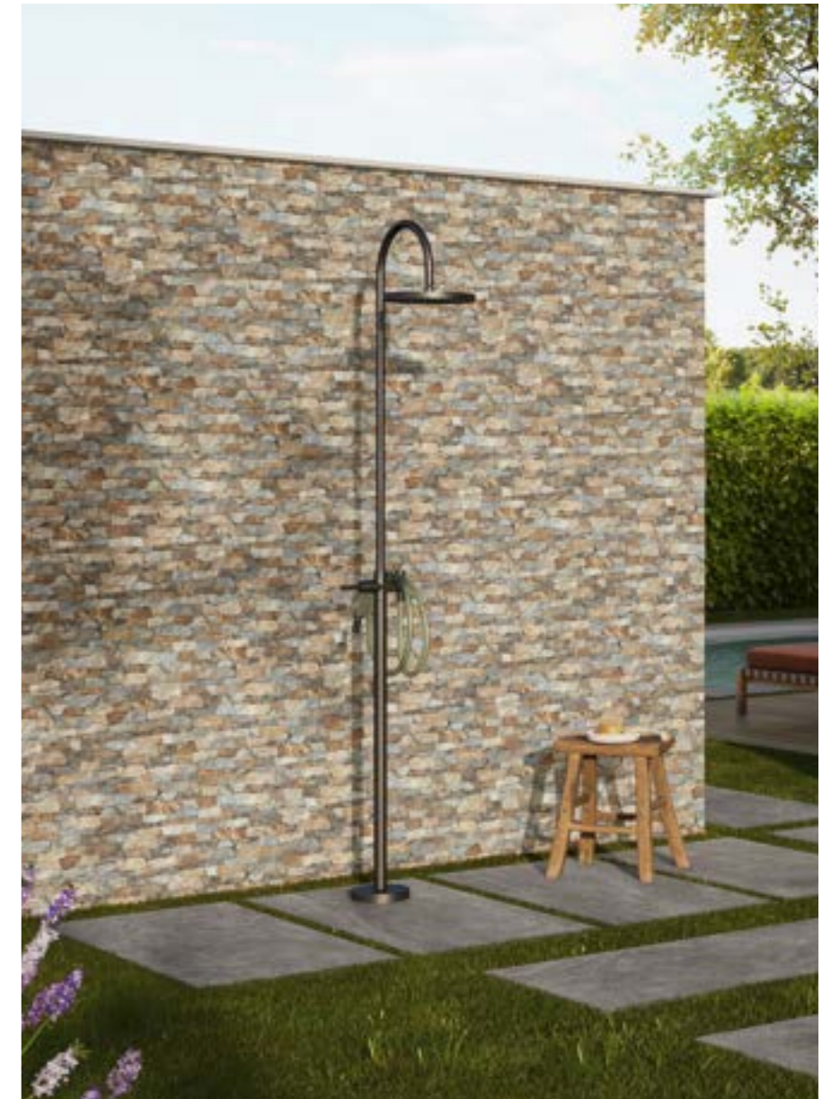
Wall: Breccia Rock Mix 16x40 Floor: ASPEN Basalt 60x120 20 MM