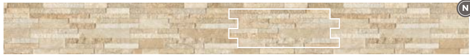
Ocean Travertino Honey - BKP 314