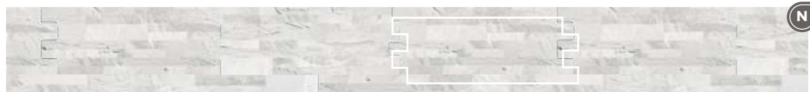
Ocean White Mix - BKP 814