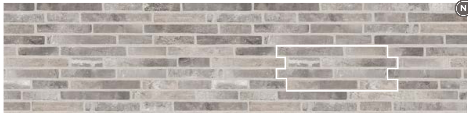
New York Grey - BKP 167