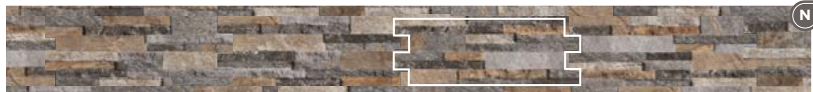
Ocean Mix Quarzite - BKP 014