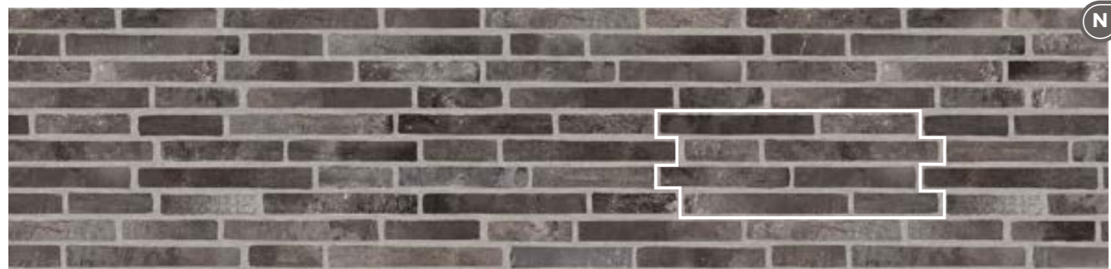
New York Smoke - BKP 267