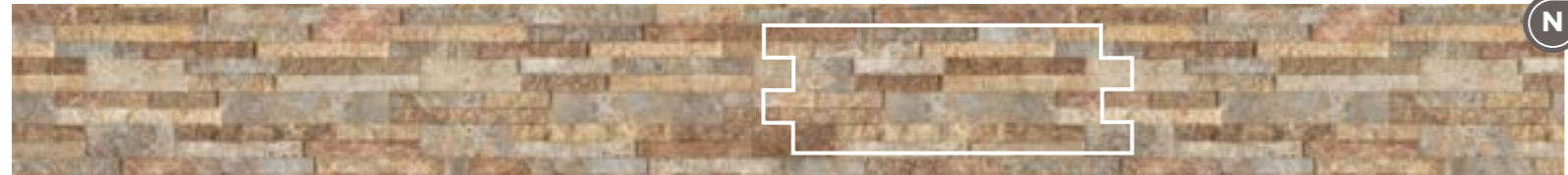
Ocean Travertino Mix - BKP 614