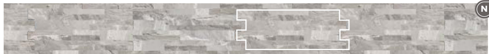
Ocean Grey - BKP 114