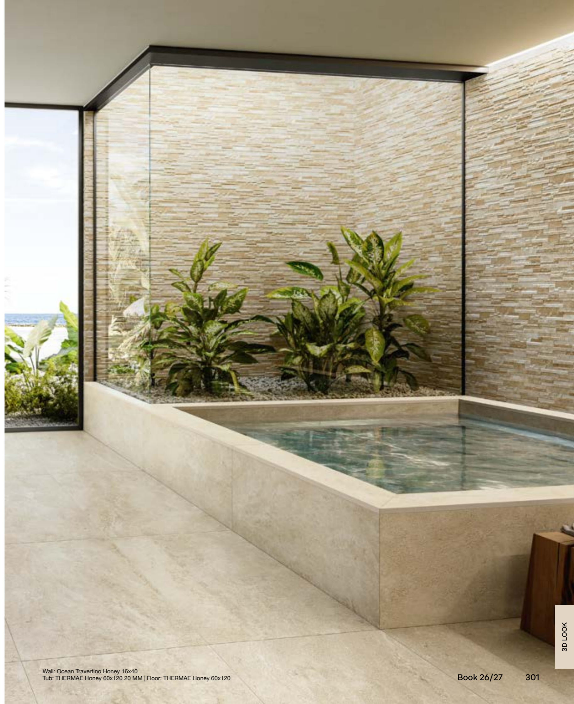
Wall: Ocean Travertino Honey 16x40 Tub: THERMAE Honey 60x120 20 MM | Floor: THERMAE Honey 60x120