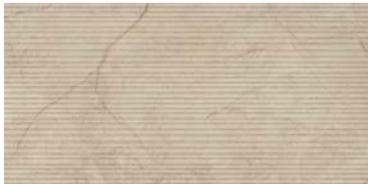
60x120 - 24"x48" ATL 65RT Struttura 3D Ribbed Shade River Rett.