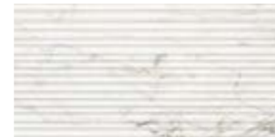
30x60 - 12"x24" ATL 13RT Struttura 3D Ribbed Supreme Capraia Rett.