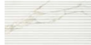
30x60 - 12"x24" ATL 33RT Struttura 3D Ribbed Calacatta Grey Rett.