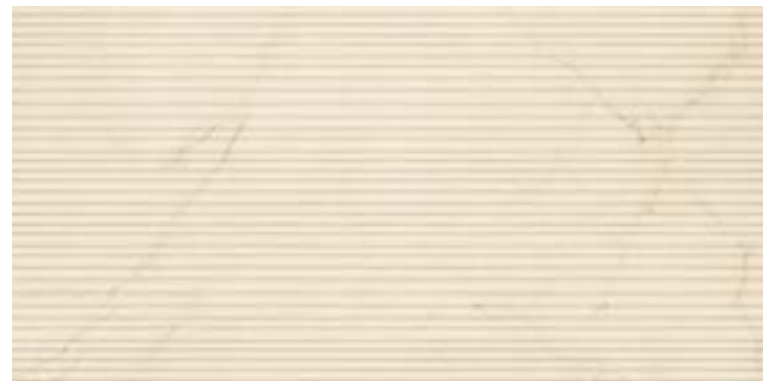
60x120 - 24"x48" ATL 55RT Struttura 3D Ribbed Cozy Marfil Rett.