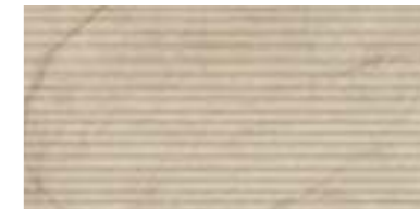
30x60 - 12"x24" ATL 63RT Struttura 3D Ribbed Shade River Rett.