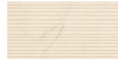
30x60 - 12"x24" ATL 53RT Struttura 3D Ribbed Cozy Marfil Rett.