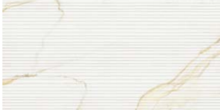
60x120 - 24"x48" ATL 45RT Struttura 3D Ribbed Calacatta Gold Rett.