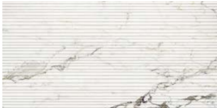
60x120 - 24"x48" ATL 15RT Struttura 3D Ribbed Supreme Capraia Rett.