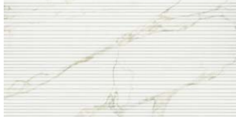
60x120 - 24"x48" ATL 35RT Struttura 3D Ribbed Calacatta Grey Rett.