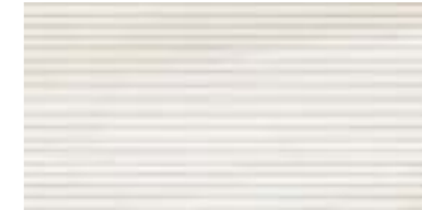
30x60 - 12"x24" ATL 23RT Struttura 3D Ribbed Crystal Dolomia Rett.