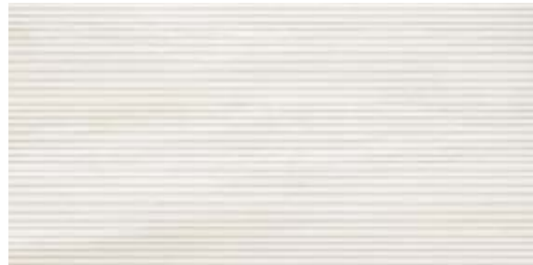
60x120 - 24"x48" ATL 25RT Struttura 3D Ribbed Crystal Dolomia Rett.