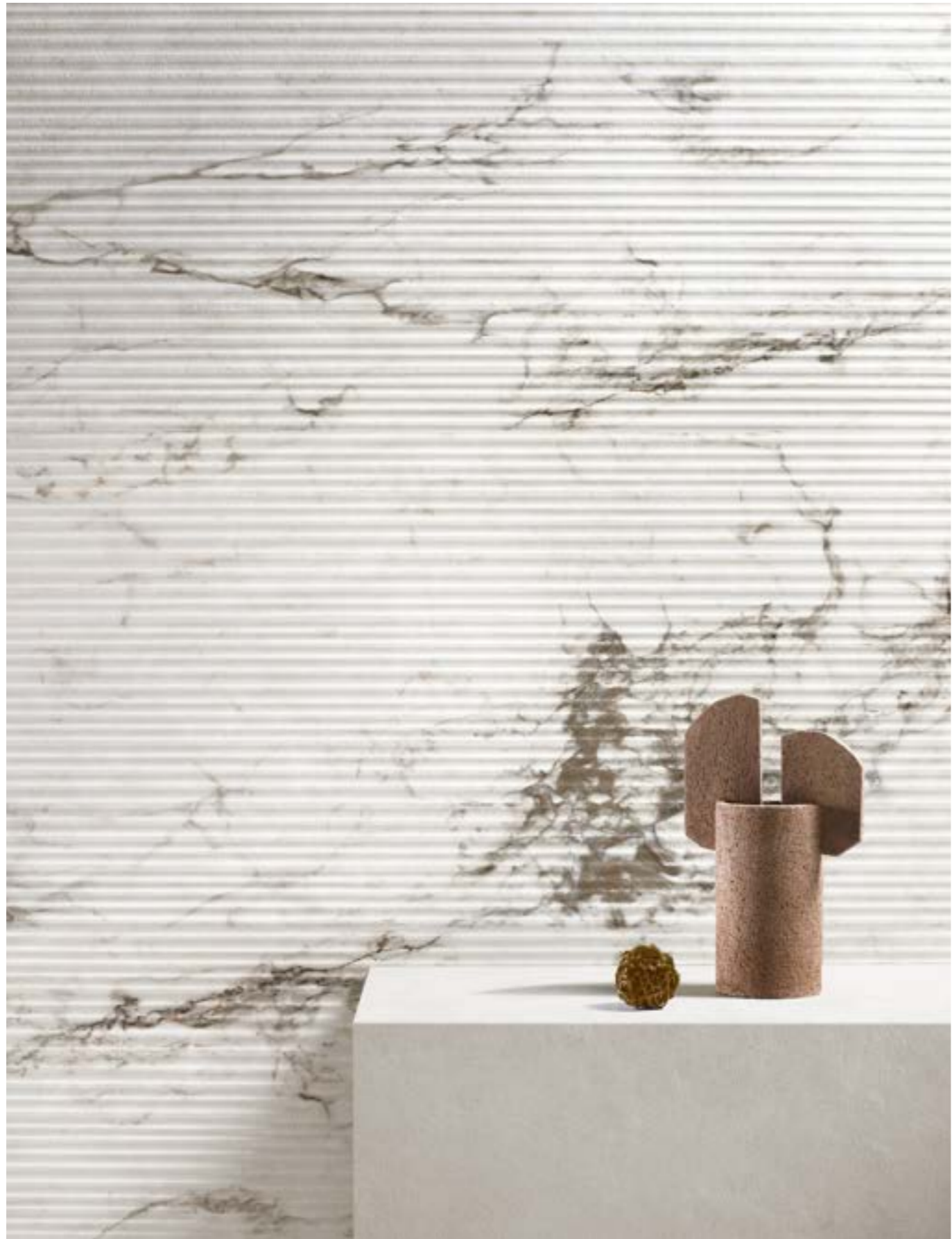
Wall: Supreme Capraia 3D Ribbed 60x120