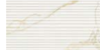
30x60 - 12"x24" ATL 43RT Struttura 3D Ribbed Calacatta Gold Rett.