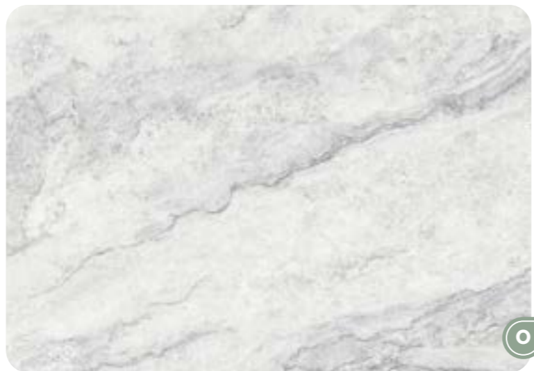
Urbe White Grey